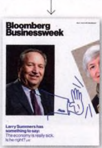
Larry Summers has something to say: The economy is really sick. Is he right?