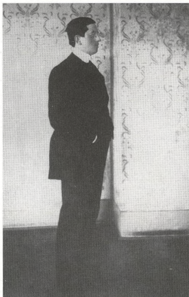
Josef Čapek, approx 1905

The family moves to Úpice, a small town near Trutnov, where Karel Čapek was born on January 9 th .