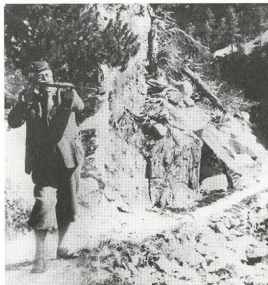
Josef Čapek shooting with a cane, 1930s

In Lidové Noviny, Josef Čapek publishes a series of anti-Hitler drawings – "The Dictator's Boots." He reacts to the news of President Masaryk's death with an illustration of an allegoric female figure in Lidové Noviny. This illustration indicated the symbolic gesture in the later "Fire" series. Exhibits at contemporary Czechoslovak art shows in Moscow, Leningrad and Paris; is included in Václav Nebeský's publication L'art Moderne Tchécoslovaque 1905-1935, published by Librairie Félix Alcan in Paris. Two of Čapek's works from his Cubist period are shown at the exhibition held to celebrate the 50-year anniversary of Mánes. The Umělecká Beseda art association holds a gala dinner in honour of Čapek's 50 th birthday. Pečirek's monograph of Josef Čapek is published as a Prameny edition; Vítězslav Nezval publishes Josef Čapek's studies at František Borový Publishers.