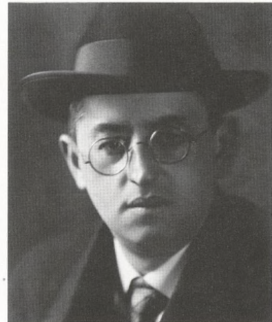
Josef Čapek, 1922.

Josef Čapek intensively focuses on book illustrations, creating an extensive series of original linocut book covers.