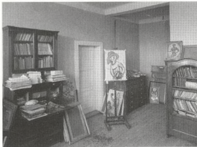
Josef Čapek's atelier, approx 1931

His series of anti-fascist caricatures starts to be published in Lidové Noviny. Josef Čapek becomes a member of the editorial board of Život, a part of the Umělecká Beseda art association; he works there until his arrest in September 1939.