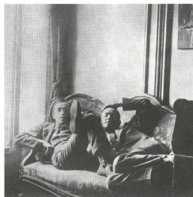
The Čapek brothers in Paris, 1911