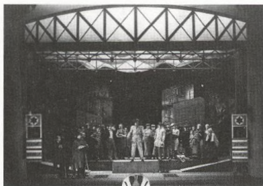
Stage design for Josef Čapek: The Land of Many Names , Municipal Theatre in Královské Vinohrady, Prague, 1923