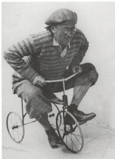
Josef Čapek, approx 1935

Josef Čapek exhibits 25 drawings at the anti-fascist International exhibition of Drawings and Humour in Prague. He is represented at an exhibition of modern Czechoslovak art in Vienna. The Group of Visual Artists in Brno organises a solo exhibition of Josef Čapek in Brno.