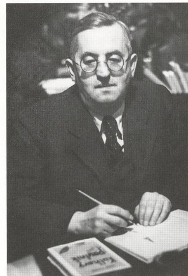
Josef Čapek signing The Limping Pilgrim, 1937

26 September – transported to Buchenwald concentration camp. Here he creates a set of small drawings and translates poetry.