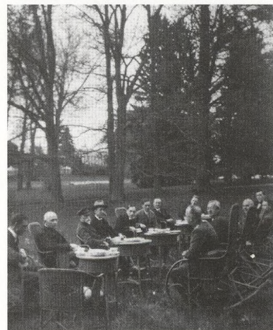
Josef Čapek in the Orava region, 1930s

For Lidové Noviny he writes a continuing series entitled The Shadow of the Fern , a literary ballad connecting the themes of Men and the countryside of Orava (published as a book in 1930 by Aventinum).