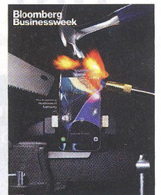
Cover: Photo illustration by Victor Prado for Bloomberg Businessweek ; prop stylist: Elizabeth Press

Facebook facebook.com/bloombergbusinessweek/ Twitter @BW Instagram @bloombergbusinessweek