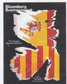
Cover: Juan Teixeira/Redux