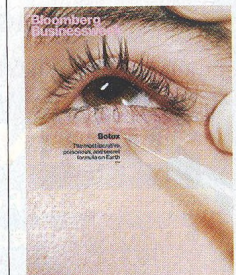
Cover: Elinor Carucci/ Trunk Archive