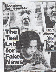
Cover: A demonstrator in Manila pauses during a protest of Trump's Nov. 14 visit to the Philippines.