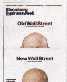
Cover: Simon Dawson/Bloomberg (2).