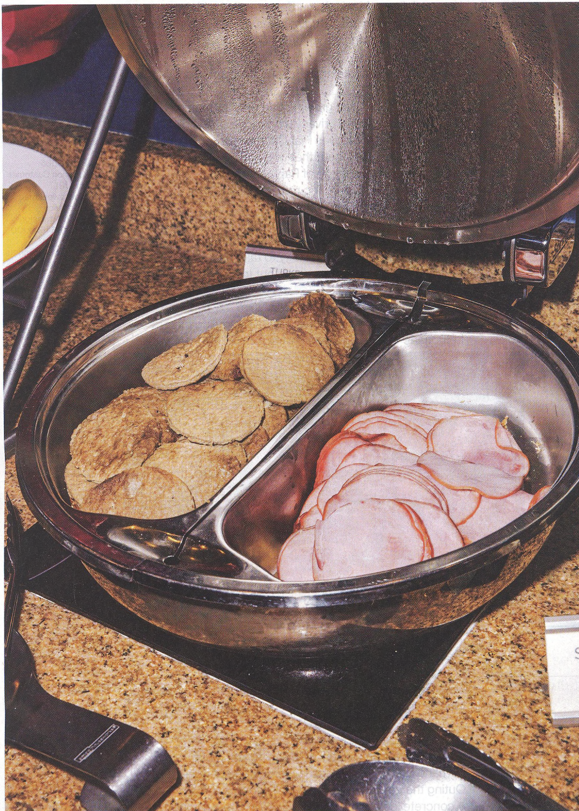
◀ Breakfast at a Fairfield Inn—a Starwood fan's worst nightmare