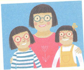
The Khan family