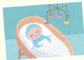
Our new baby