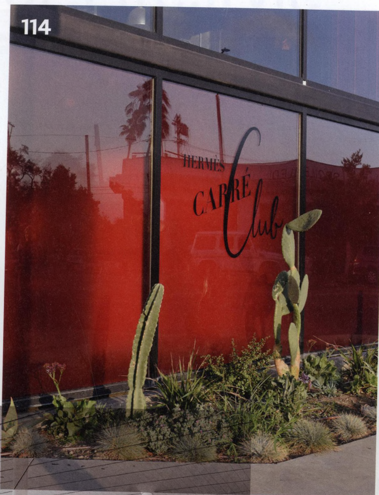
Owens Corning / BFA