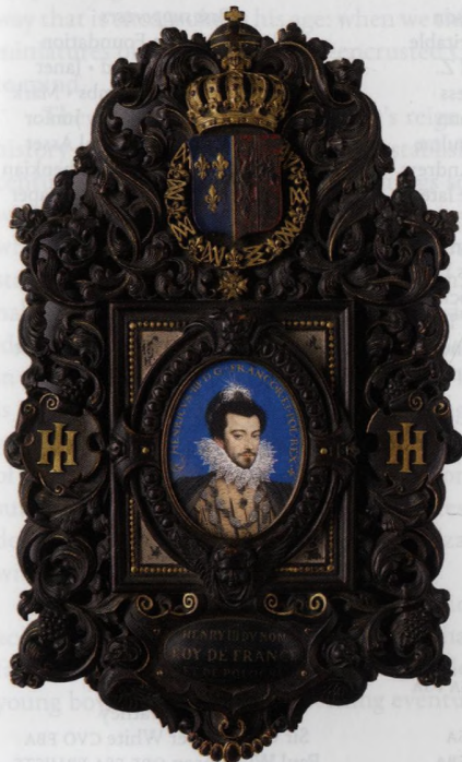
Cover Henri III of France , by Nicholas Hilliard. Here dated c.1576. (p.102 and 104). Above Renaissance-revival pierced frame with Nicholas Hilliard's miniature of Henry III. Nineteenth century (p.104). Above right King Cophetua and the beggar maid , by Edward Burne-Jones. c.1883. (p.134). Right Still from Green horses . Bruce Nauman. 1988. (p.141).