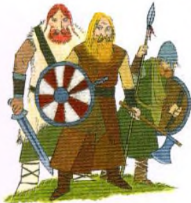
VIKINGOVÉ strana 6