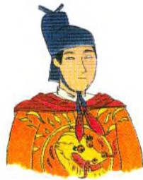
ČENG CHE strana 14