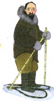
ROALD AMUNDSEN strana 82