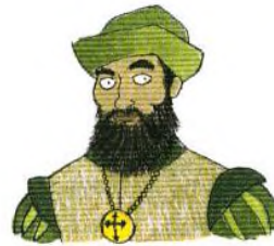
FERNÃO DE MAGALHÃES strana 34