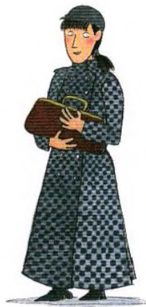
NELLIE BLY strana 70