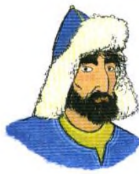
MARCO POLO strana 10