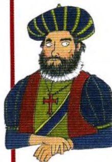
VASCO DA GAMA strana 26