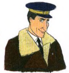
UMBERTO NOBILE strana 90