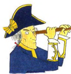
JAMES COOK strana 46