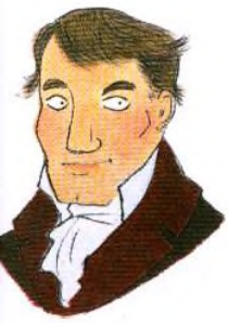
ALEXANDER VON HUMBOLDT strana 54