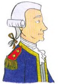
JEAN-FRANÇOIS DE LA PÉROUSE strana 50