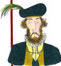
AMERIGO VESPUCCI strana 30