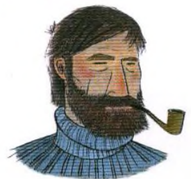
ERNEST SHACKLETON strana 86