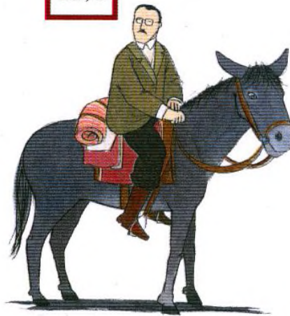
SVEN HEDIN strana 74