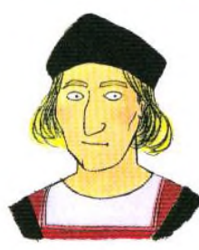
KRYŠTOF KOLUMBUS strana 18