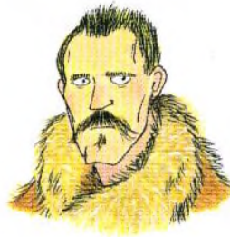
FRIDTJOF NANSEN strana 78