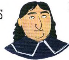
VITUS JONASSEN BERING strana 42