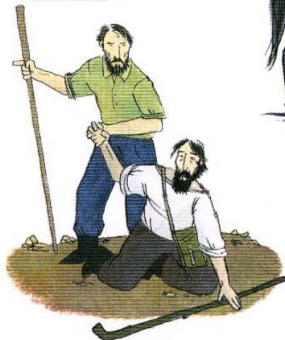
ROBERT O'HARA BURKE A WILLIAM JOHN WILLS