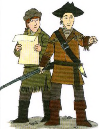
MERIWETHER LEWIS A WILLIAM CLARK strana 58