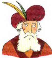
JOHN CABOT strana 22