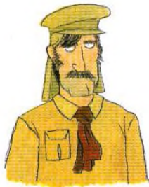
DAVID LIVINGSTONE strana 62