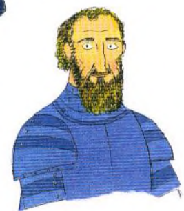
GIOVANNI DA VERRAZZANO strana 38