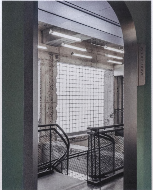
Sun Liwen, courtesy of Harmay