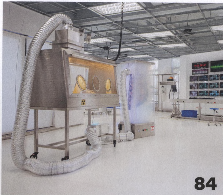
Wang Minjie, courtesy of Xianxiang Design