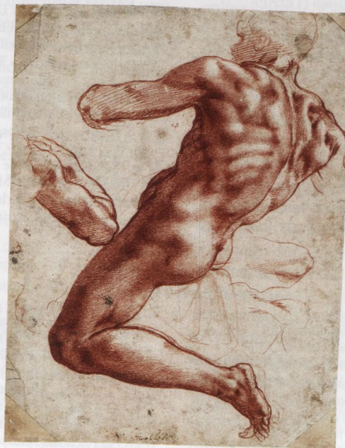
Cover Detail of Female figure , by Umberto Boccioni. 1911. (p.221). Above left Detail of David with the head of Goliath , by Artemisia Gentileschi. c.1639. (p.189). Above Seated male nude, with separate study of his right arm, by Michelangelo. 1511. (p.245). Above right Pyx, by Luigi Valadier. 1769–71. (p.196).