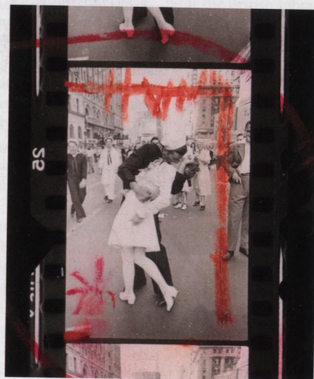
Cover Detail of The Immaculate Conception , by Diego Velázquez. c.1618–19. (p.1028). Above left Detail of St Jerome , by El Greco. 1590–1600. (p.1147). Above Detail of a contact sheet of photographs by Alfred Eisenstaedt, 15th August 1945. (p.1103). Top right Lion attacking a dromedary , by Edouard Verreaux. 1867. (p.116).