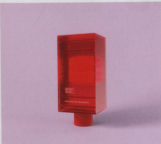
Note Design Studio