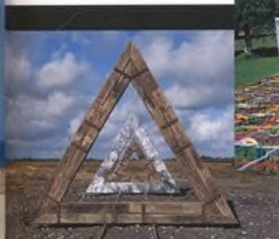
Sculpture in the Parklands