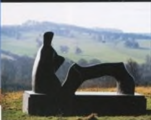
Yorkshire Sculpture Park