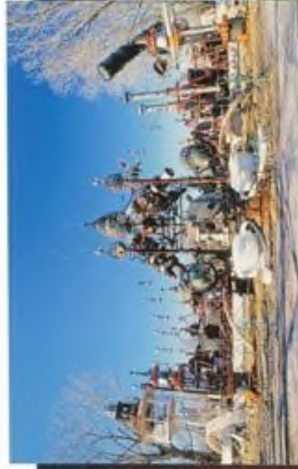
Below: Art Montage