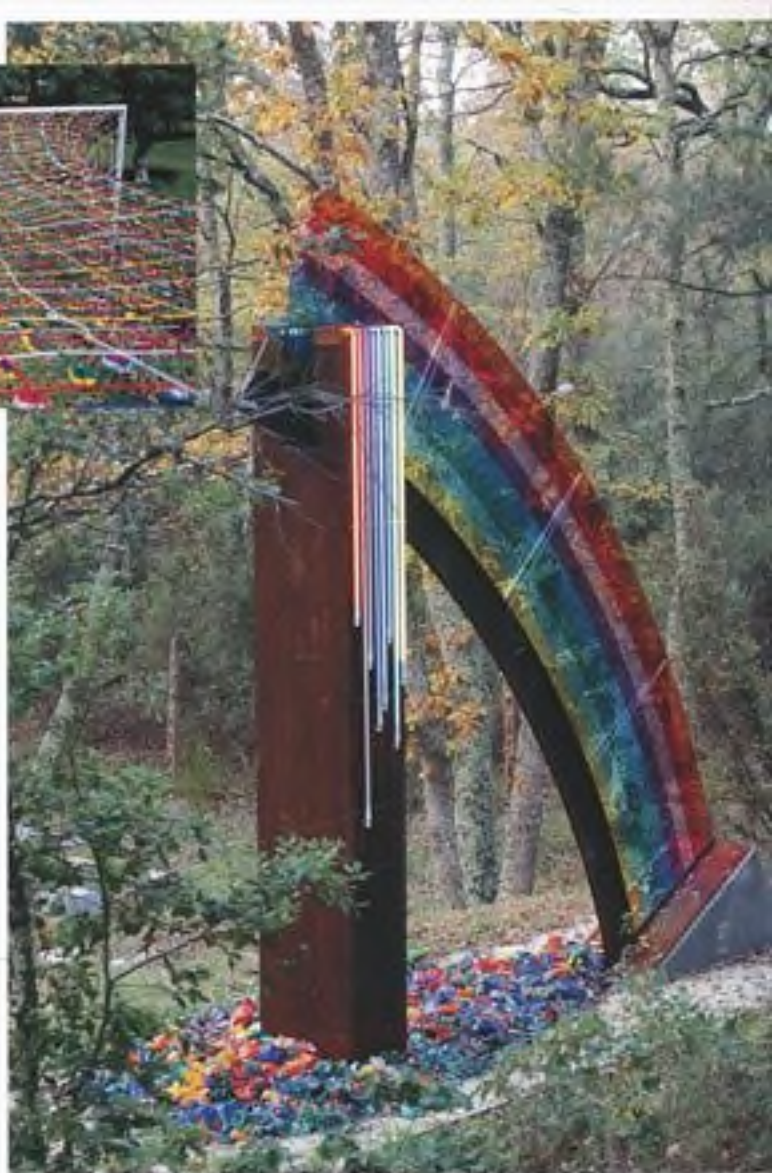
Above Parco Sculture del Chiari