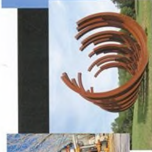
Below: Urban Configuration