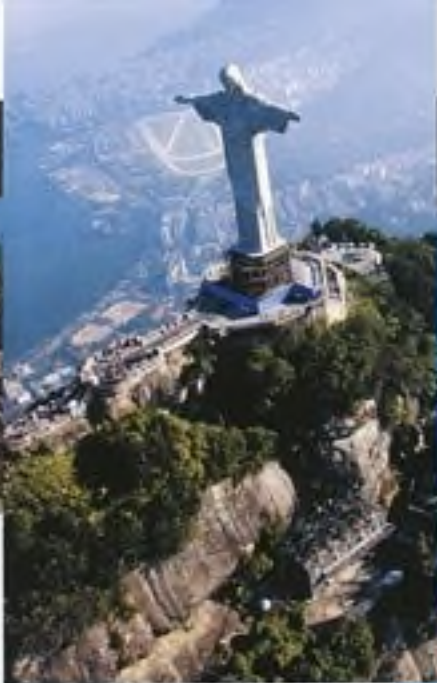
Christ the Redeemer of the Open Arms