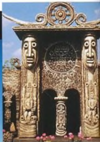
Left Torre de Satélite Above La Frénésie