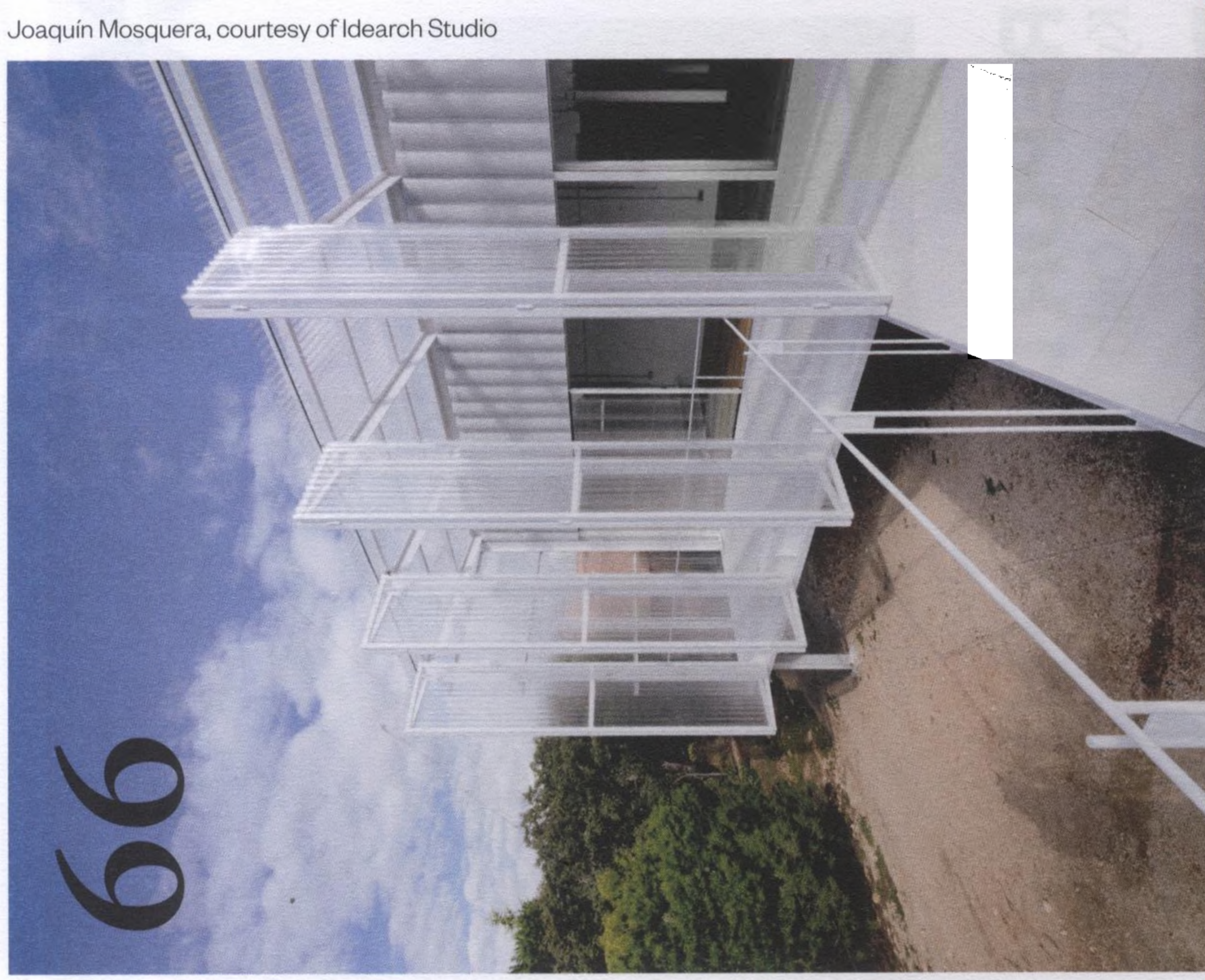
Joaquín Mosquera