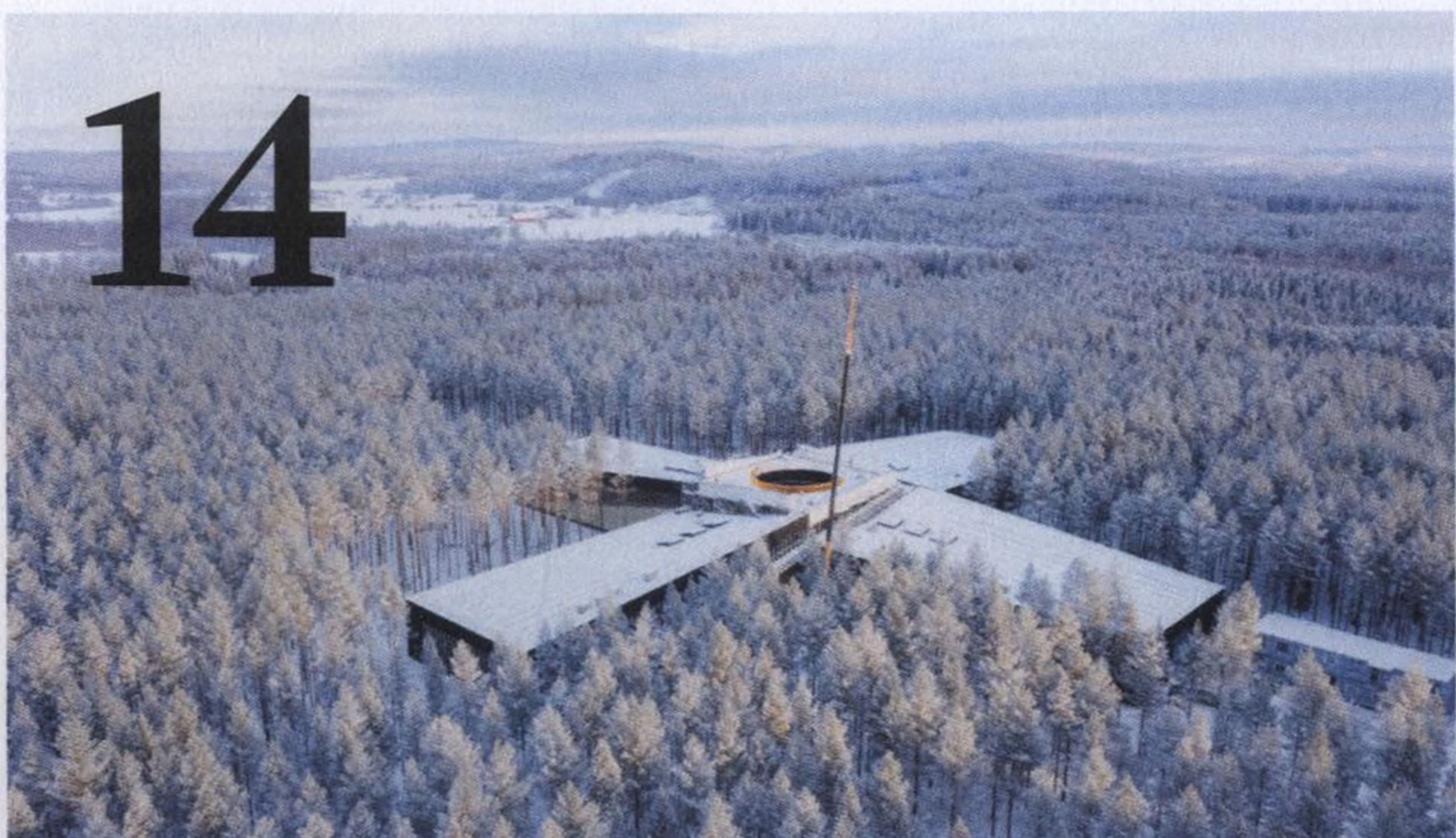
Einar Aslak, courtesy of Vestre