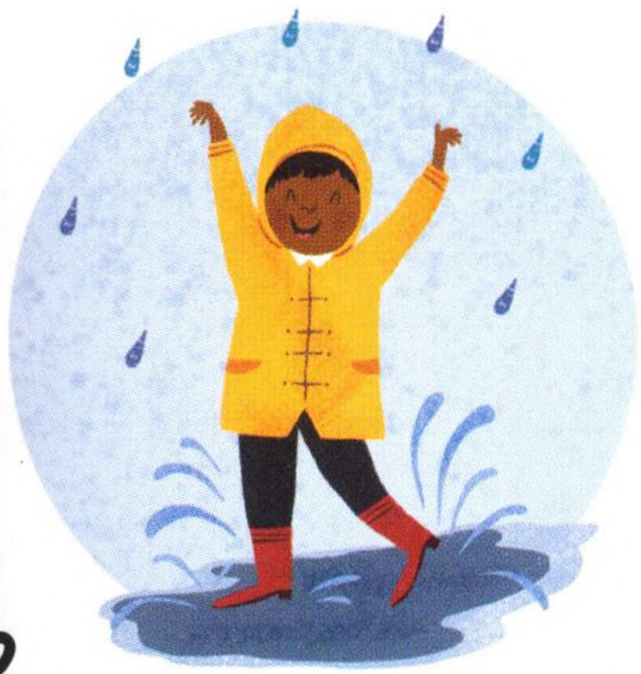
28 Weather and seasons