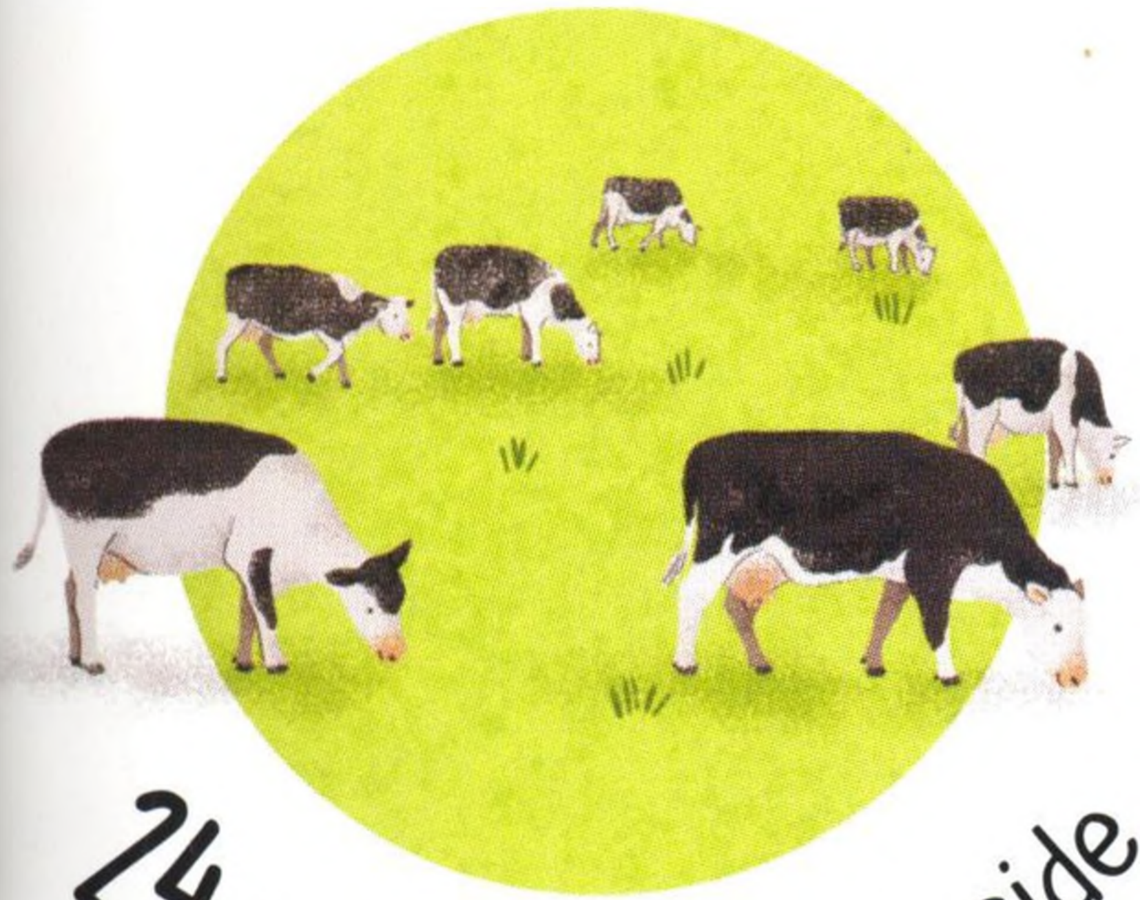
24 In the countryside