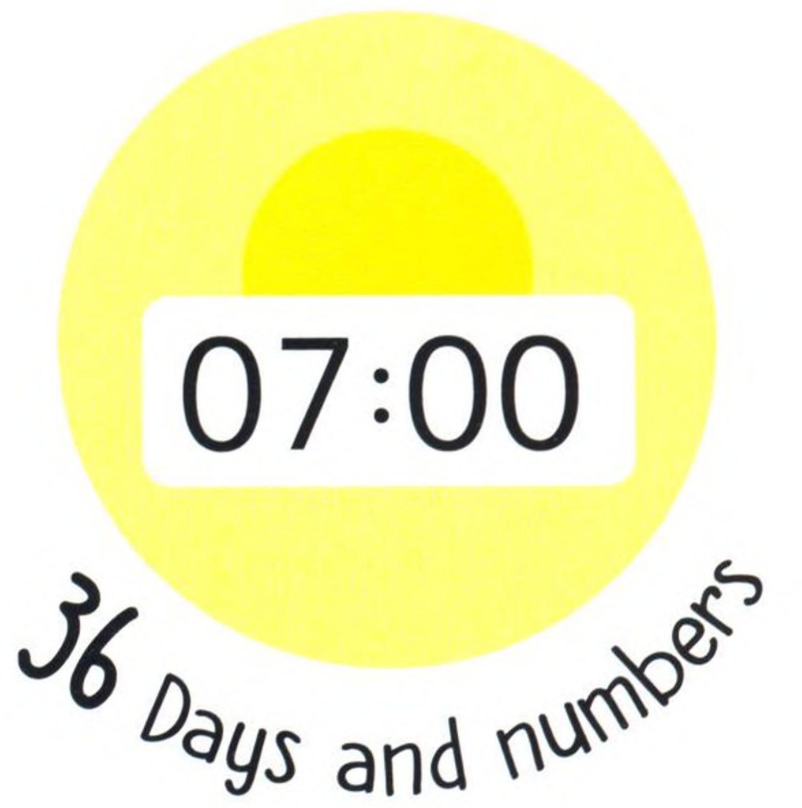
36 Days and numbers