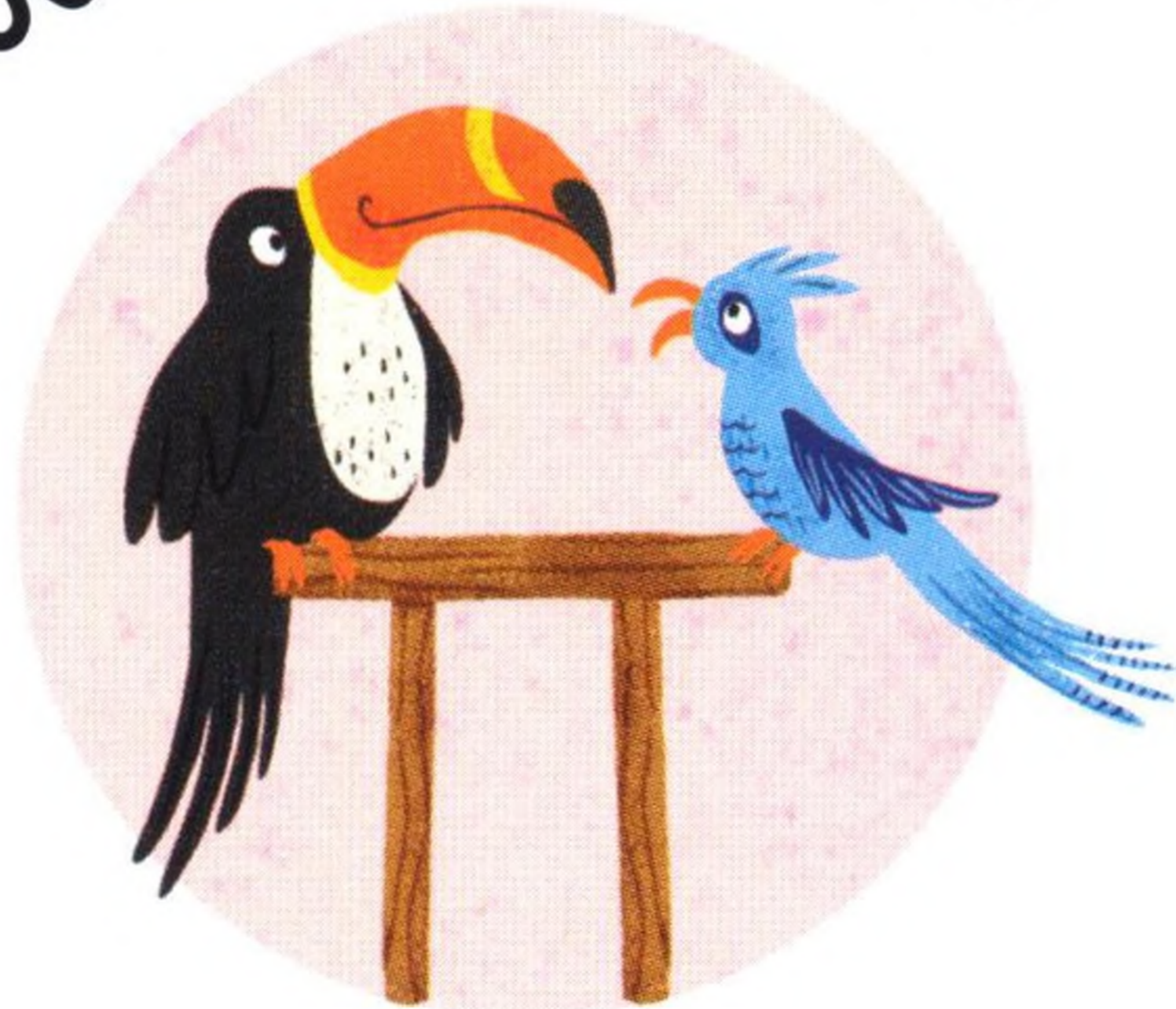
35 Position words