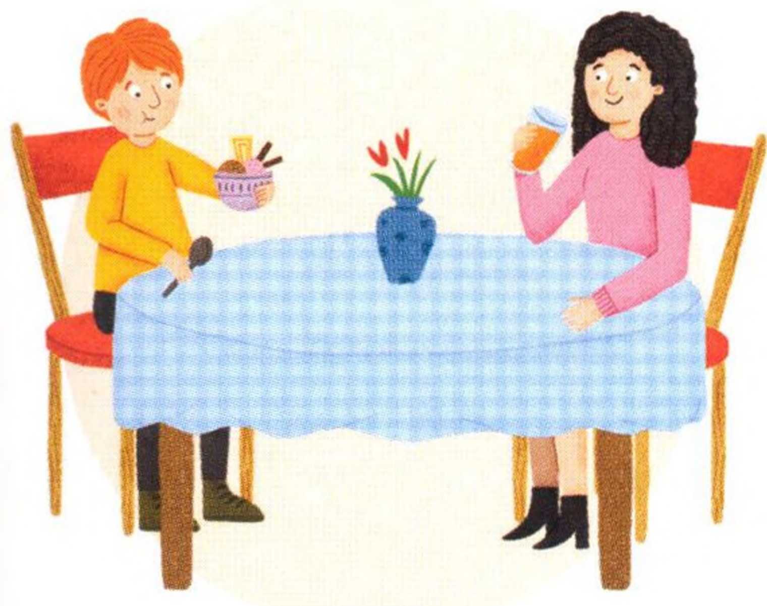
19 Going out