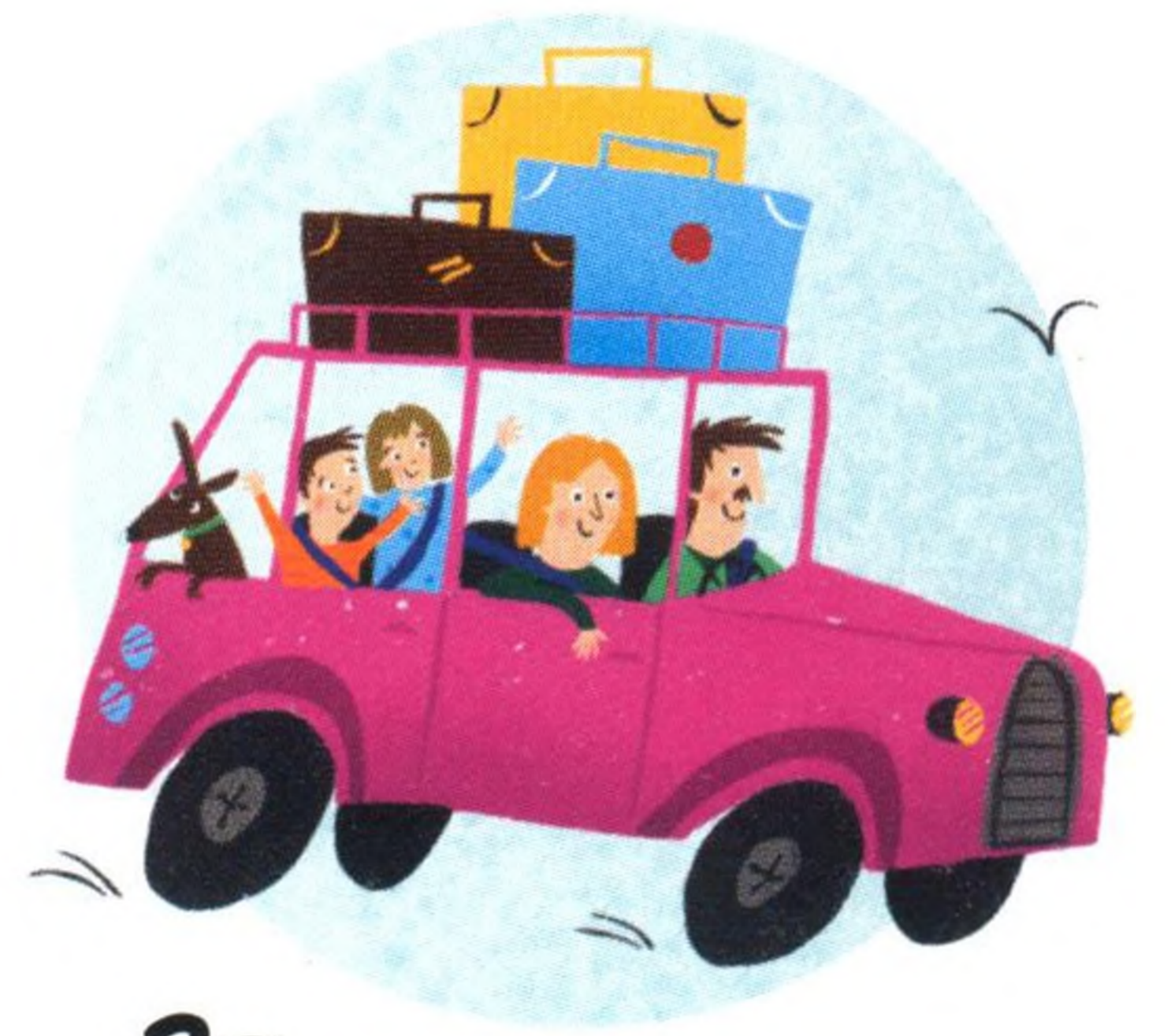
22 Travel words