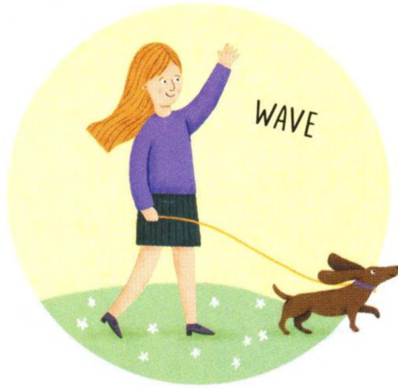
20 Doing words