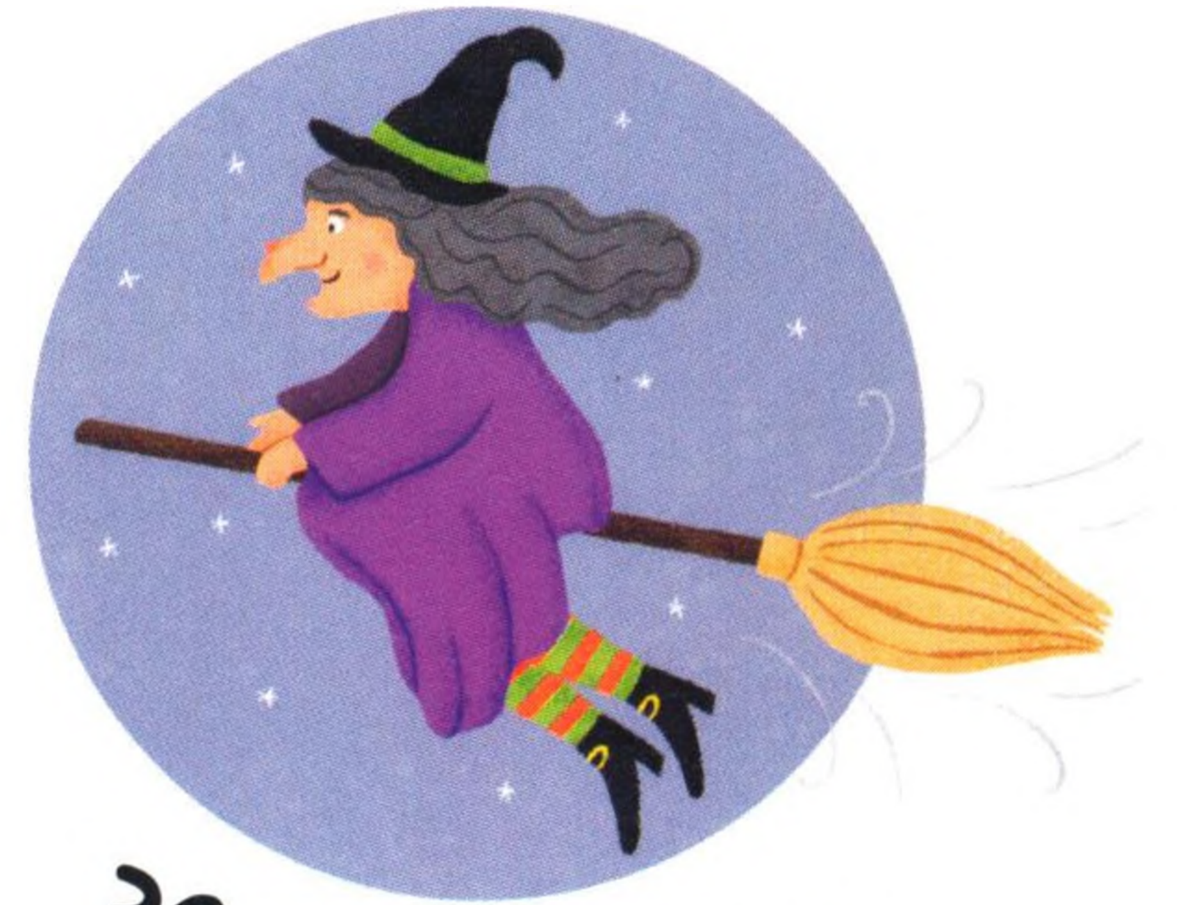
32 Story words