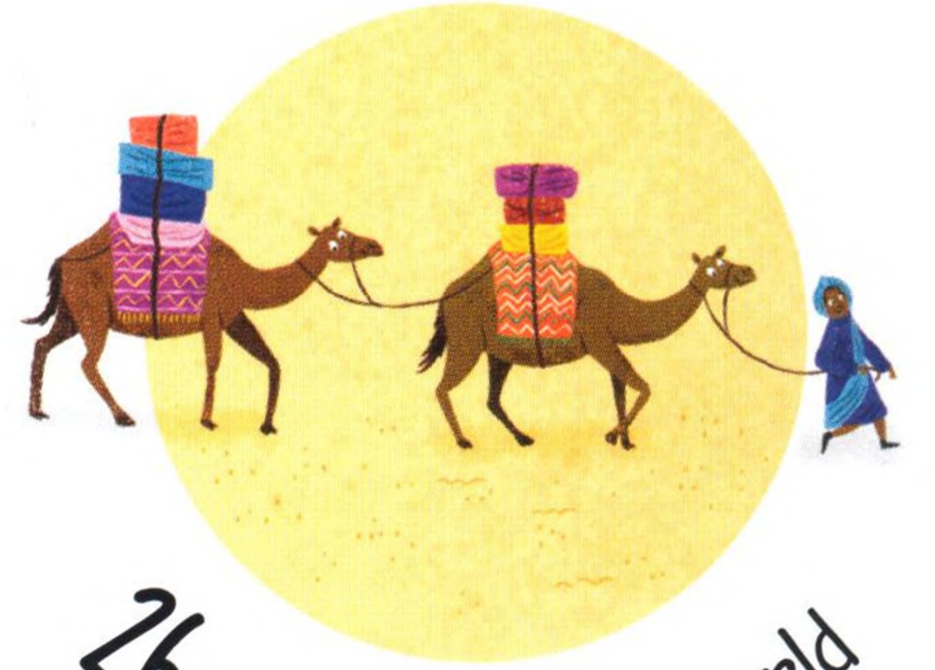
26 Around the world