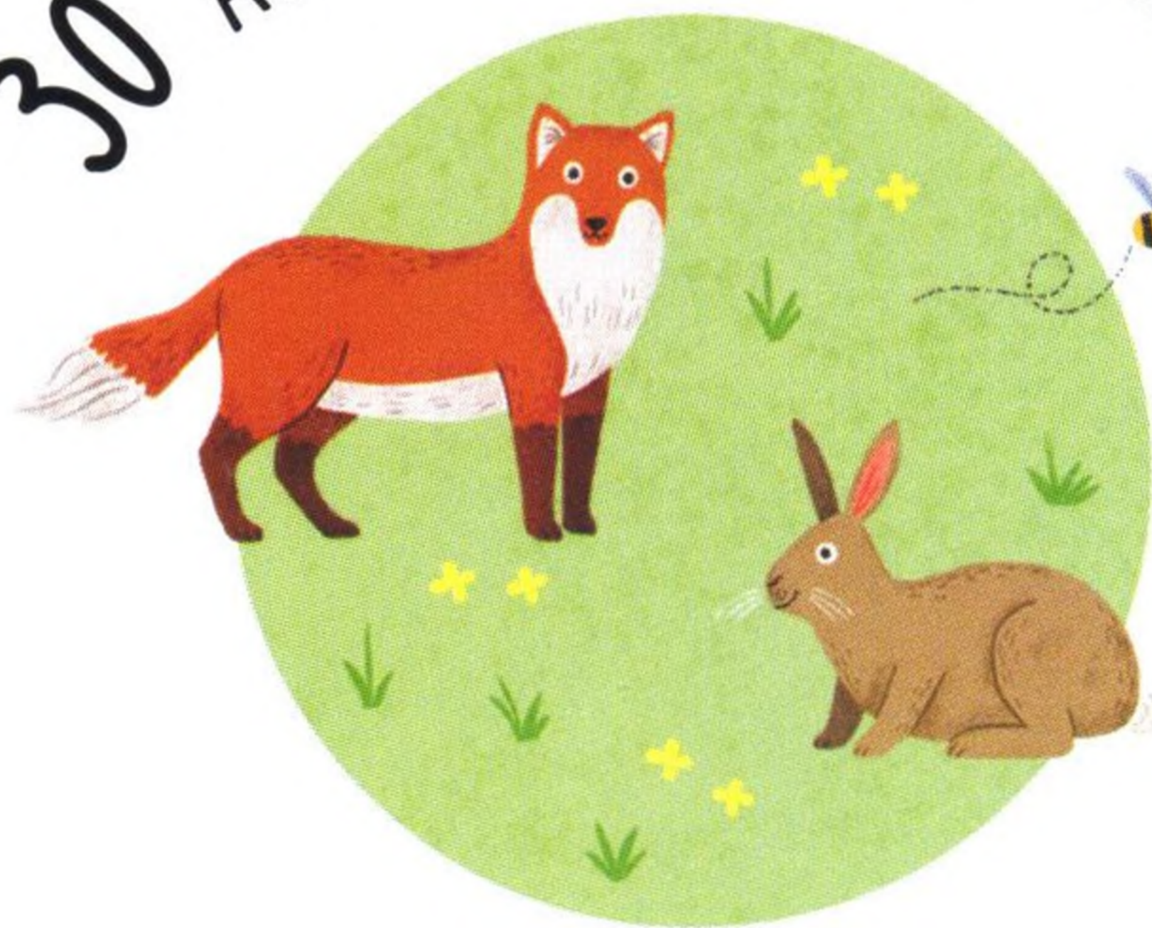
30 All kinds of animals