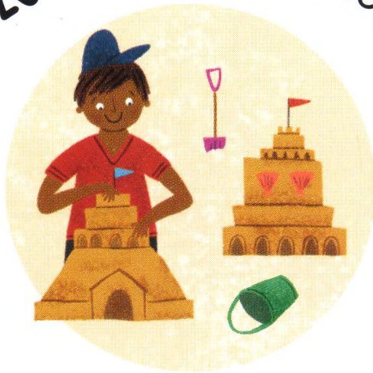
25 At the seaside