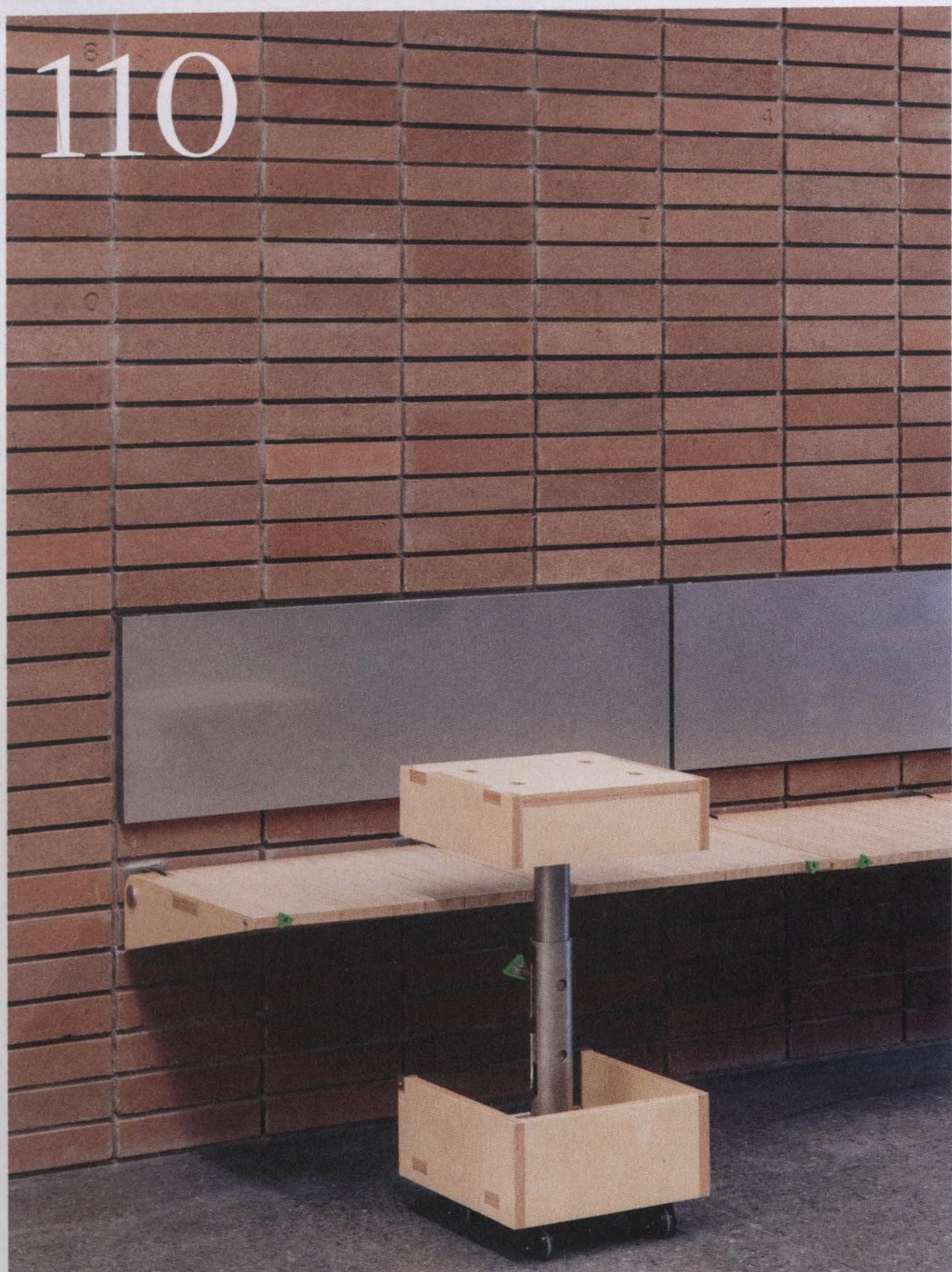
Men Studio