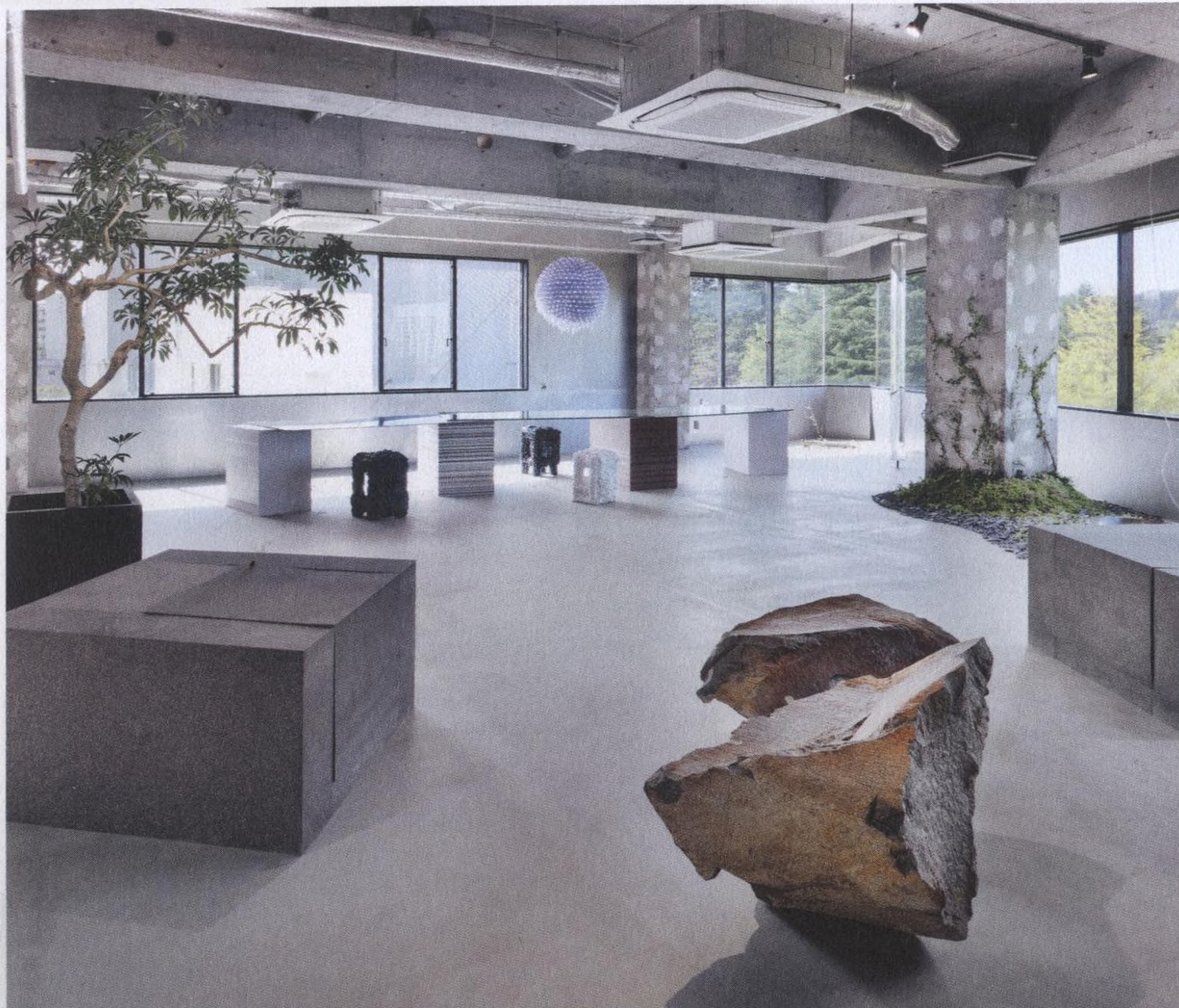
Takumi Ota, courtesy of Takt Project