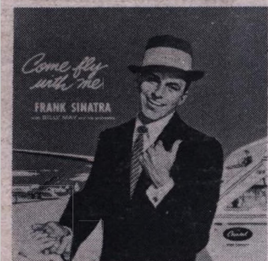
COME FLY WITH ME • Let's Get Away From It All; Isle of Capri; Around the World; Come Fly With Me; Autumn in New York; April in Paris; Blue Hawaii; more. LCT 6154

Among other Capitol albums by Frank Sinatra: