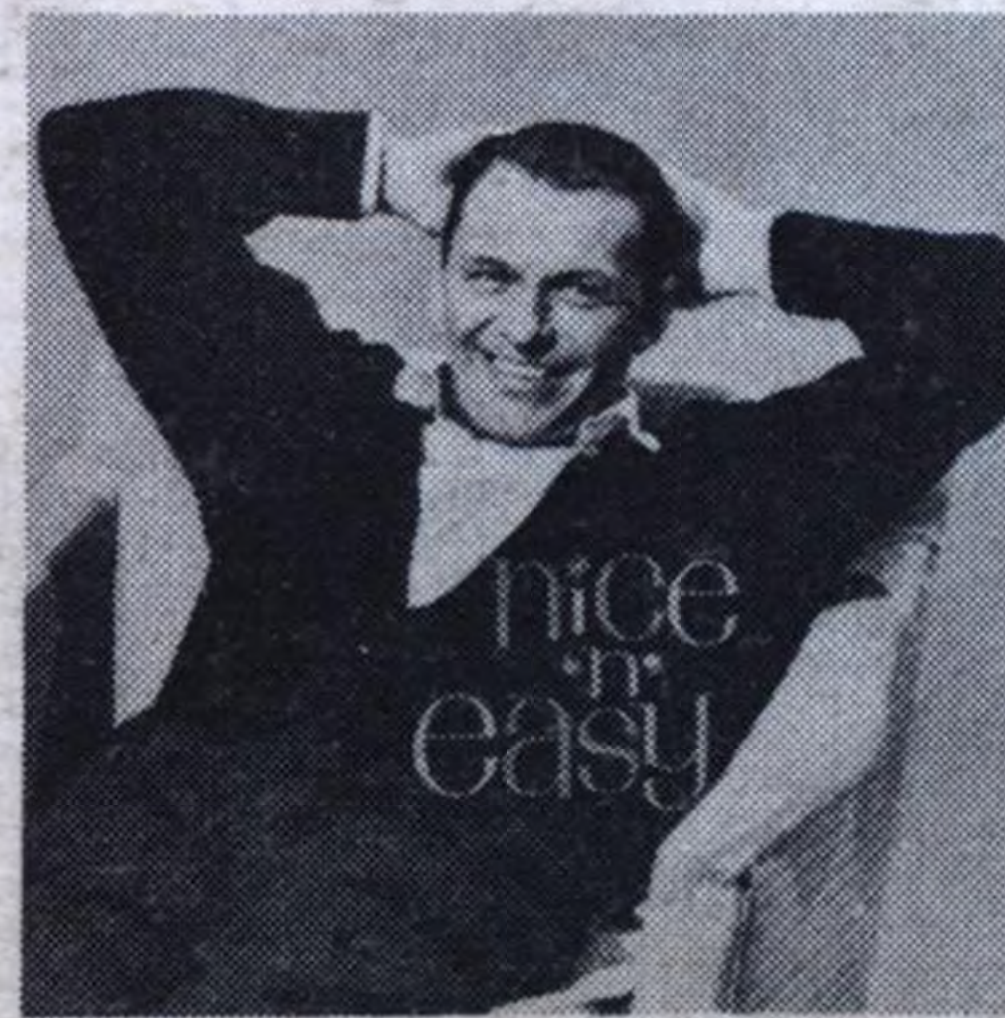
NICE 'N' EASY • Mam'selle; She's Funny That Way; You Go to My Head; I've Got a Crush on You; Fools Rush In; That Old Feeling; Nice 'n' Easy; Dream; Nevertheless; more. (S)W 1417