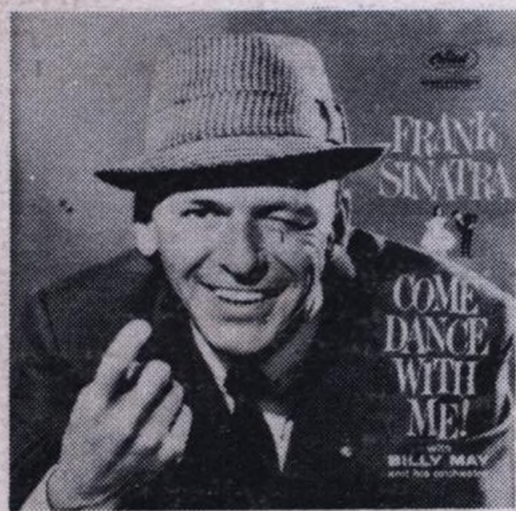
COME DANCE WITH ME • Day In, Day Out; Something's Gotta Give; Dancing in the Dark; The Last Dance; Too Close for Comfort; Baubles, Bangles and Beads; more. LCT 6179