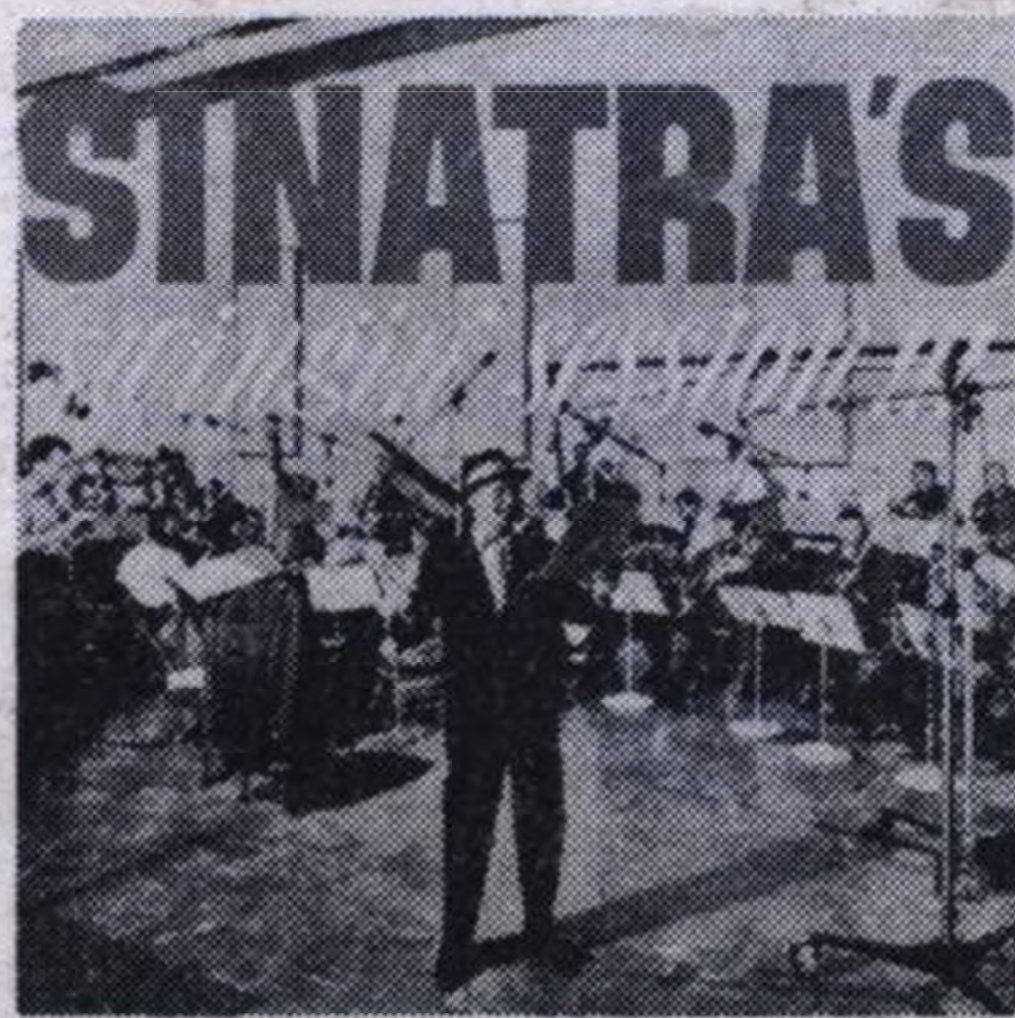
SINATRA'S SWINGIN' SESSION • September in the Rain; Blue Moon; It's Only a Paper Moon; Should I; You Do Something to Me; Always; My Blue Heaven; more (S)W 1491