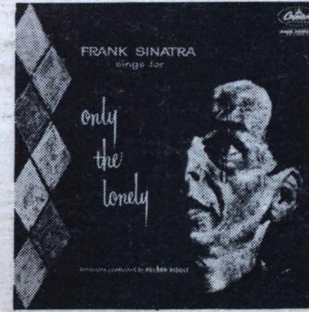
ONLY THE LONELY • It's a Lonesome Old Town; Spring is Here; Ebb Tide; One for My Baby; Blues in the Night; Gone with the Wind; Only the Lonely; more. LCT 6168