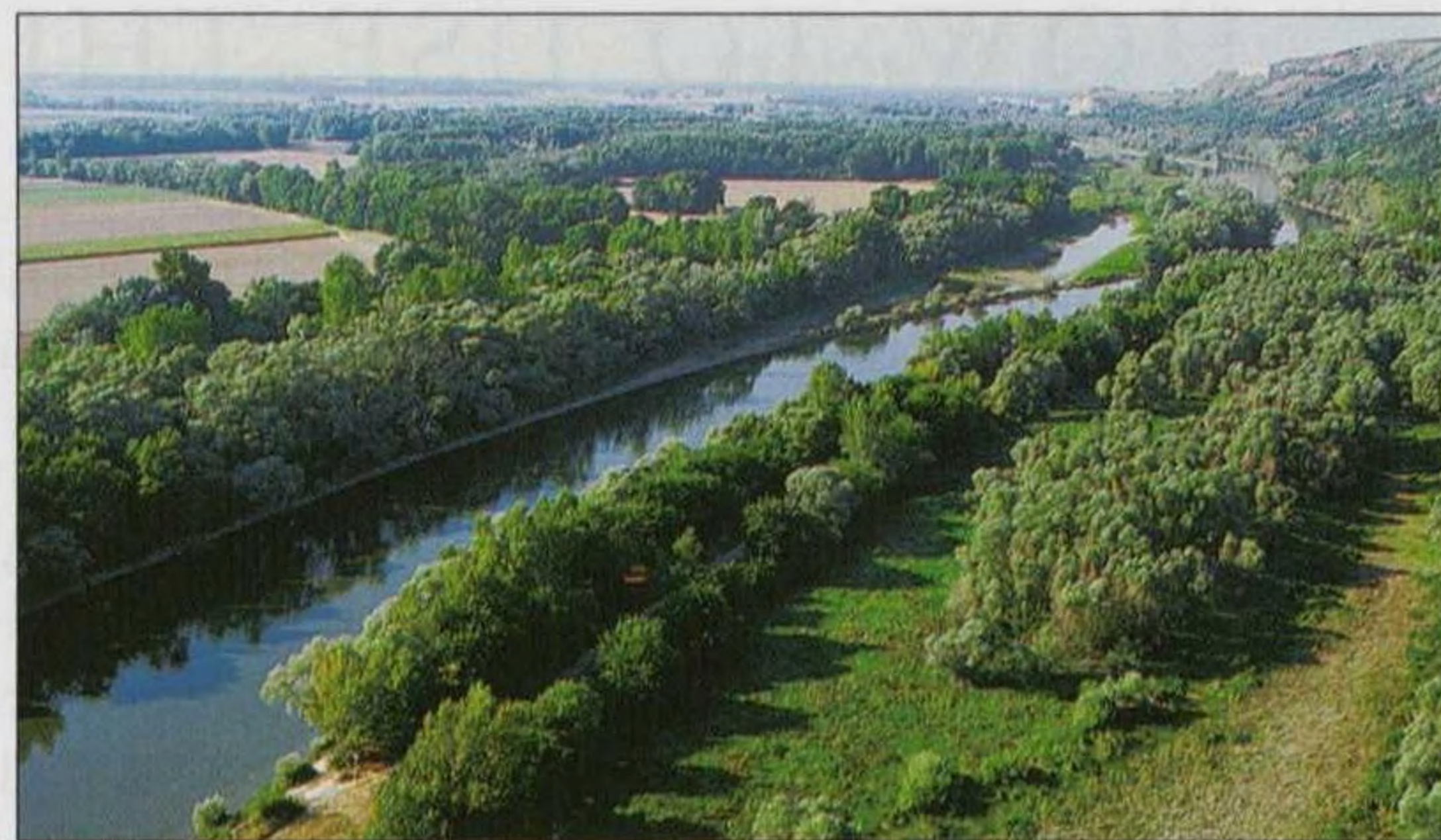
The Morava river flowing at the foot of Devin Castle in Bratislava