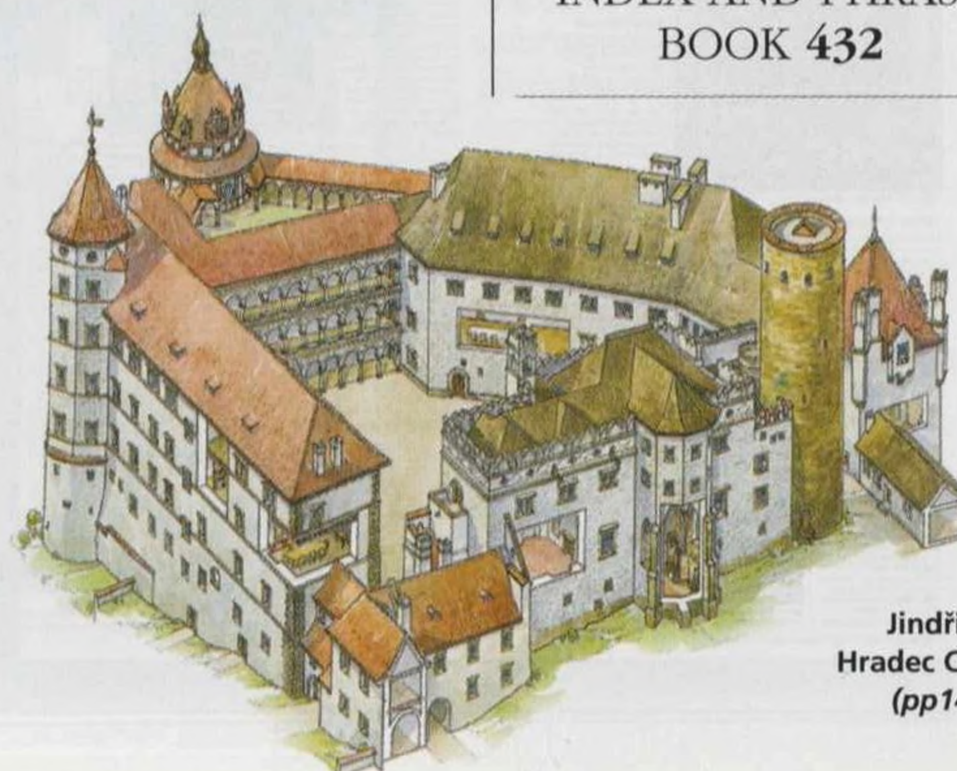
Jindřichův Hradec Castle (pp144-5)