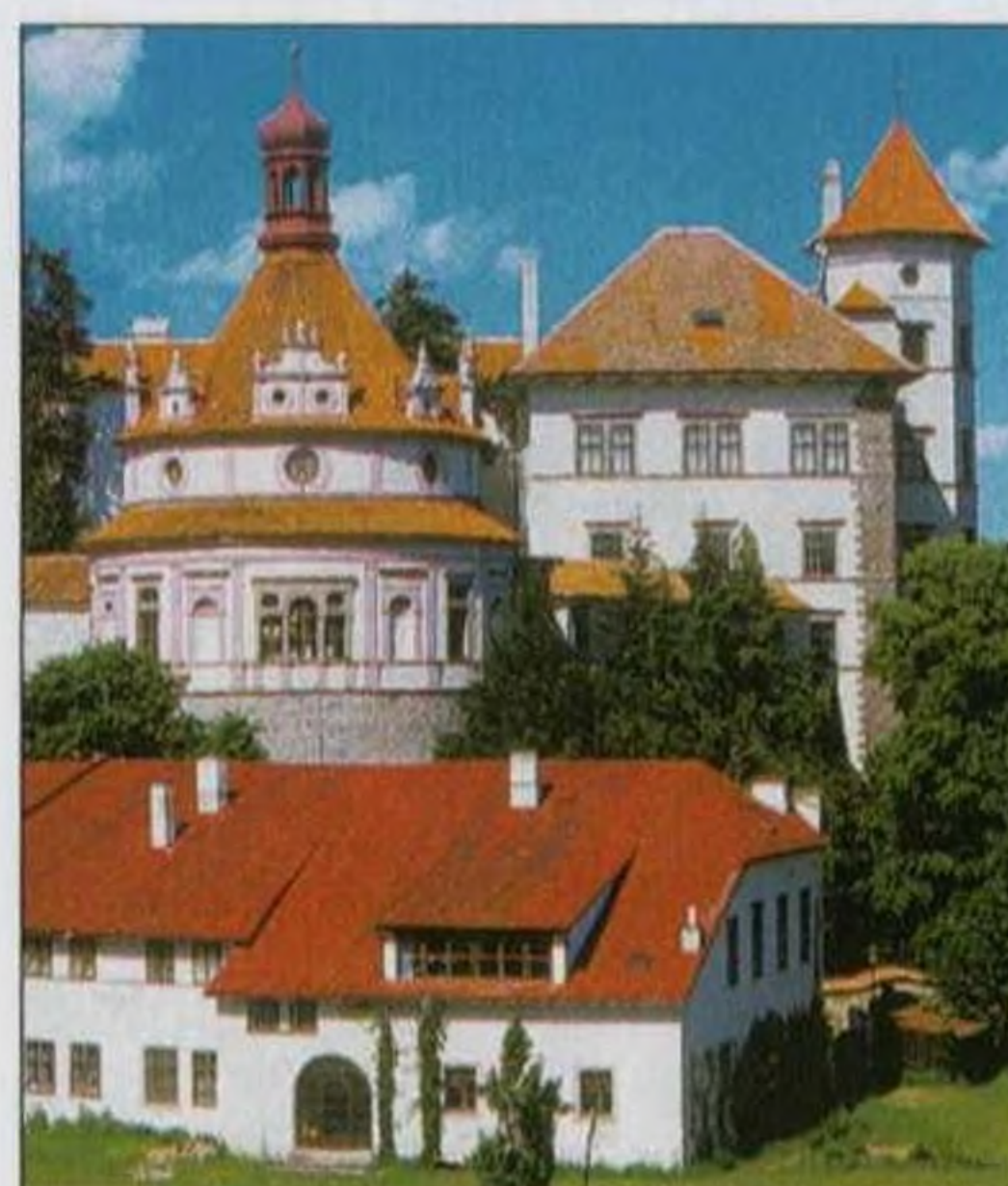
Colourful roofs, Jindřichův Hradec Castle, South Bohemia