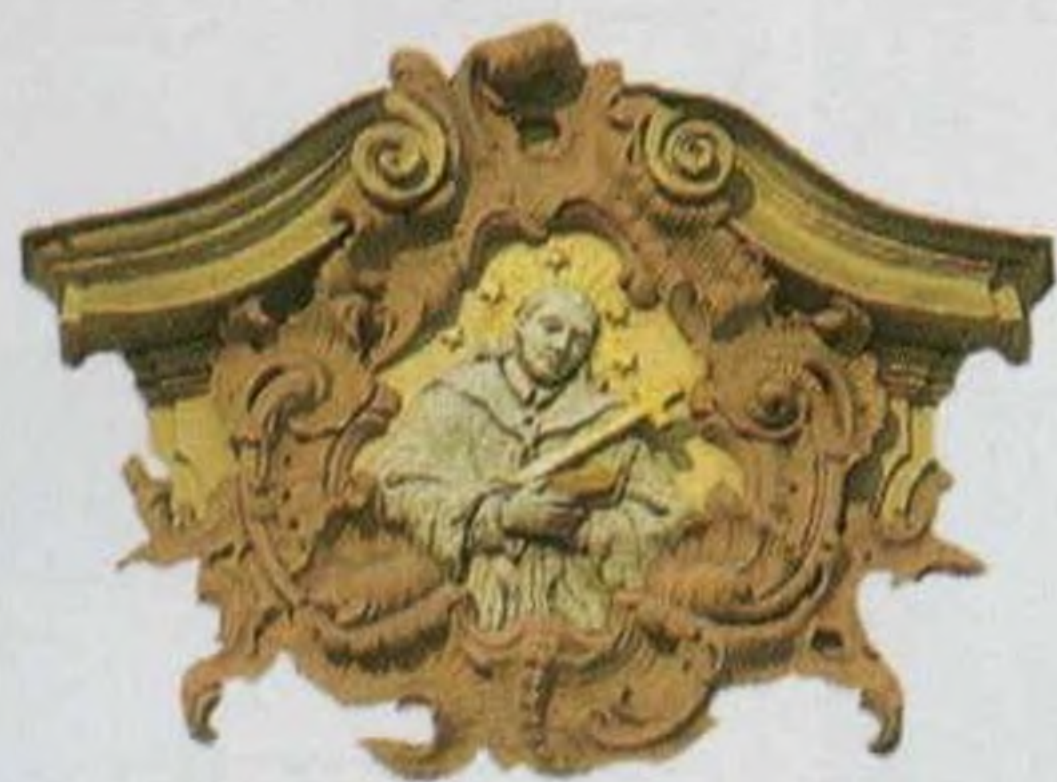
Stucco decorations on the façade of Kinský Palace, in Prague