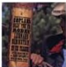
CD 4 MS 6175