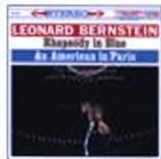
CD 6 MS 6091