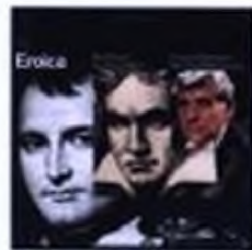
CD 1 MS 6774

This special edition collects some of the conductor-composer's most celebrated interpretations and works: the still-astonishing album that launched Bernstein's international reputation as the most dynamic and charismatic conductor of his era, Stravinsky's Rite of Spring (1958); his Mahler 3 that launched the "Mahler Renaissance" in the 1960s; Bernstein the composer with the original Broadway cast recordings of Candide and West Side Story ; Beethoven's "Eroica", Dvořák's "New World", Copland's Rodeo and Billy the Kid , Gershwin's Rhapsody in Blue and American in Paris – all in all, the perfect introduction to the work of genius "Lenny".