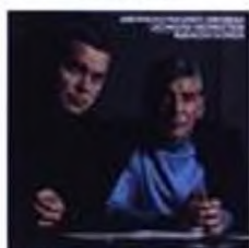
CD 8 KM 30942