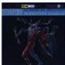
CD 11 MS 6010