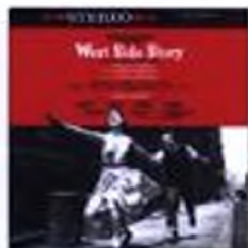
CD 2 OS 2001