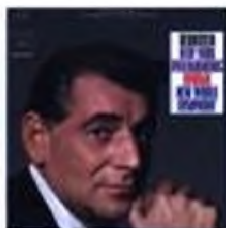
CD 5 MS 6393