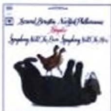
CD 7 MS 6609