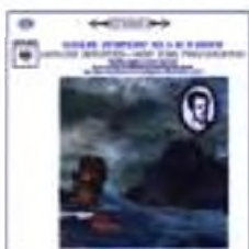
CD 9/10 M2S 675